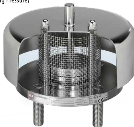
Model 942-EV End-of-Line (Emergency) Pressure Relief Vent/Valve

Available in sizes DN 50 (2"), DN 80 (3"), DN 100 (4"), DN 150 (6"), DN 200 (8"), DN 250 (10")