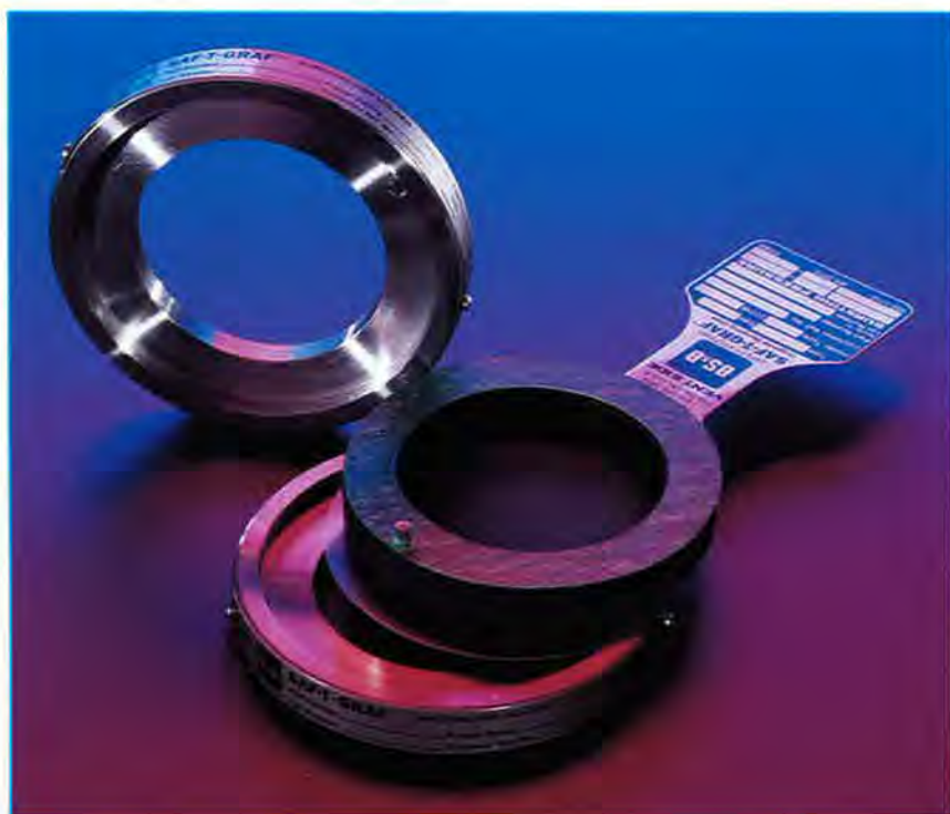
Type REL graphite disk in REL-7R 316SS safety head.

Safety heads are available in impregnated graphite or 316SS as standard.