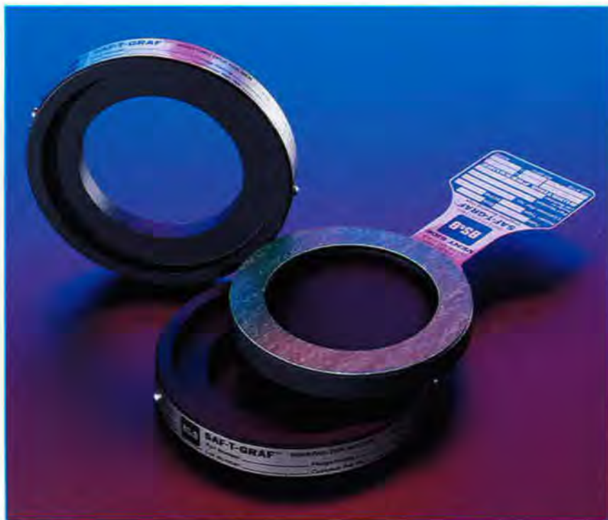
Type RE graphite disk in RE-7R graphite safety head.

The RE type disk is installed in a precision machined RE-7R safety head for direct installation between standard international pipe flanges.