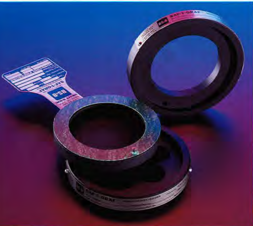
Type REV graphite disk in REV-7R graphite safety head.