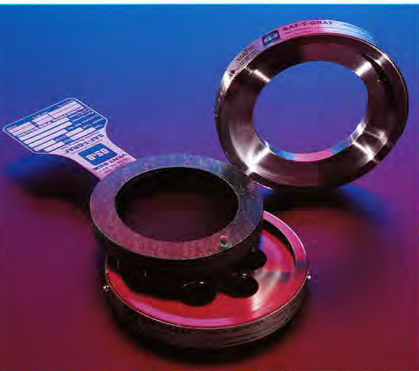
Type REV graphite disk in REV-7R 316SS safety head.

Safety heads are available in impregnated graphite or 316SS as standard.